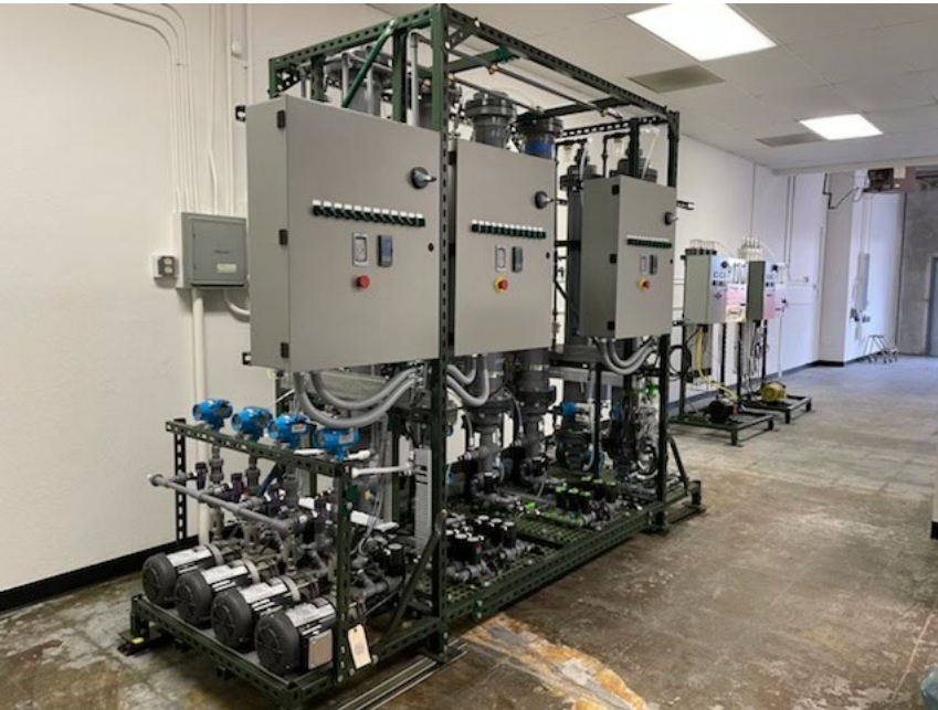
Lithium Extraction Pilot Skid @ 10 L brine/min